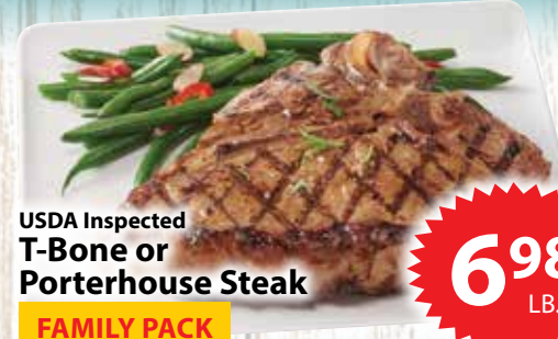
USDA Inspected T-Bone or Porterhouse Steak