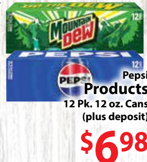
Pepsi Products 12 Pk. 12 oz. Cans (plus deposit)