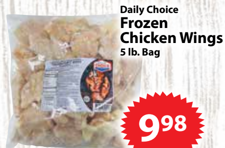
Daily Choice Frozen Chicken Wings 5 lb. Bag