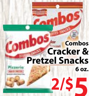
Combos Cracker & Pretzel Snacks 6 oz.