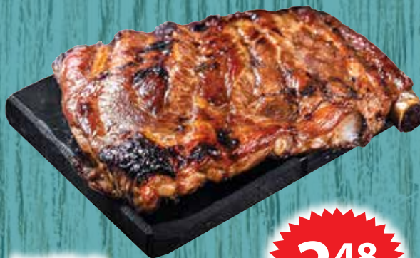
Lean & Meaty Pork Spareribs Sold In Cryovac Pkg.