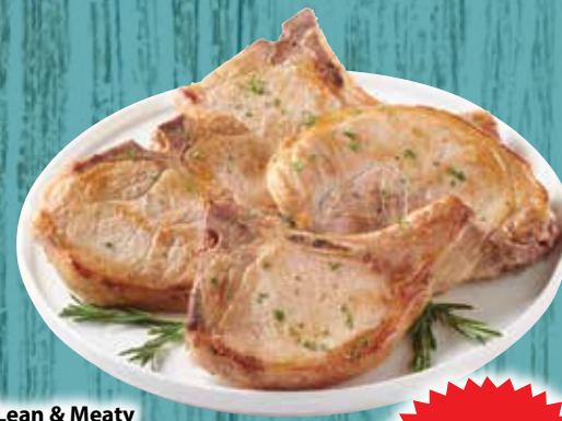
Lean & Meaty Assorted Pork Chops