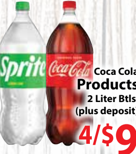
Coca Cola Products 2 Liter Btls. (plus deposit)