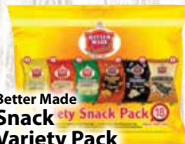
Better Made Snack Variety Pack 18 ct.