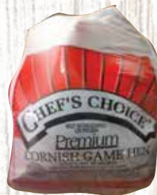
Chef's Choice Premium Cornish Hens 20 oz.