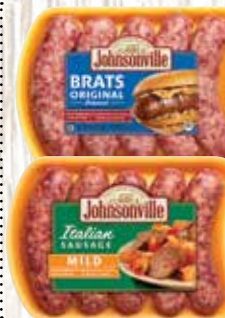
Johnsonville Original Brats or Sausage 19 oz. Selected Varieties