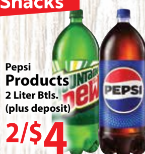
Pepsi Products 2 Liter Btls. (plus deposit)