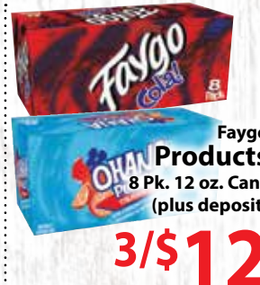
Faygo Products 8 Pk. 12 oz. Cans (plus deposit)