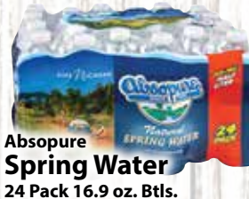
Absopure Spring Water 24 Pack 16.9 oz. Btls.