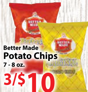
Better Made Potato Chips 7 - 8 oz.