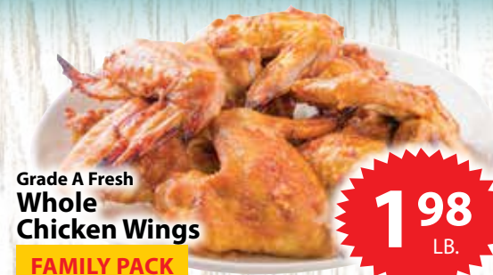
Grade A Fresh Whole Chicken Wings