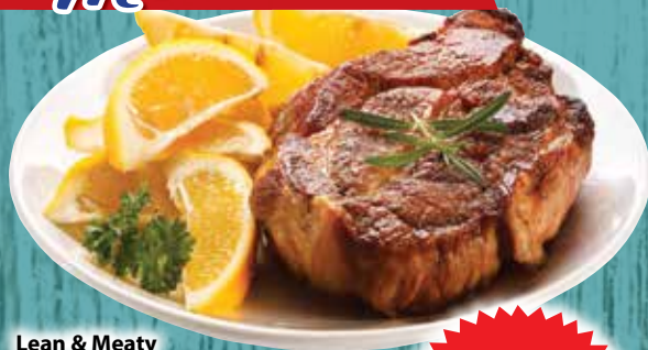
Lean & Meaty Bone-In Pork Steak