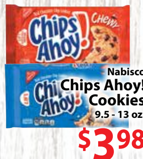
Nabisco Chips Ahoy! Cookies 9.5 - 13 oz.