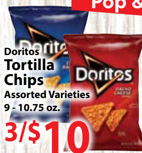
Doritos Tortilla Chips Assorted Varieties 9 - 10.75 oz.