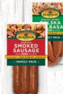
Eckrich Smoked or Polish Kielbasa 39 - 42 oz. Excludes Beef