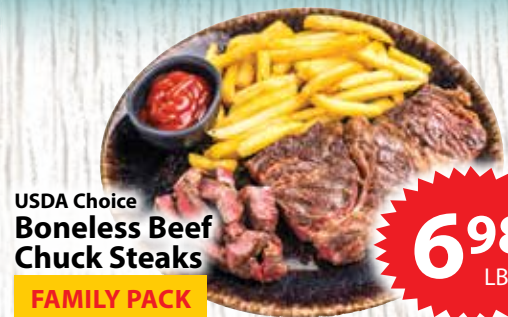
USDA Choice Boneless Beef Chuck Steaks