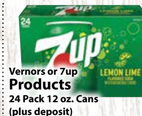
Vernors or 7up Products 24 Pack 12 oz. Cans (plus deposit)