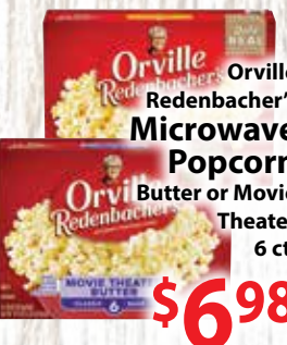
Orville Redenbacher's Microwave Popcorn Butter or Movie Theater 6 ct.